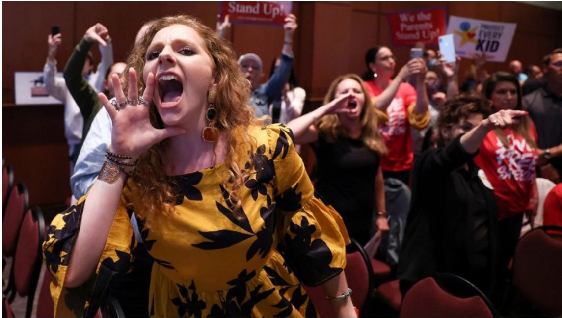
Loudoun County School Board meeting in Ashburn, Virginia, on June 22, 2021.

-- First Focus on Children This email was sent to michelekayal3@gmail.com . To stop receiving emails, click here .